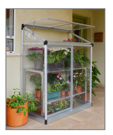
Lean To - Grow House Clear Glazing Crystal-clear panels - over 90%