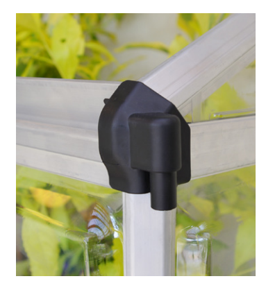
Gutter & gutter heads included