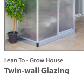
Twin-wall panels - maintain inner temperature and diminish strong sunlight exposure.