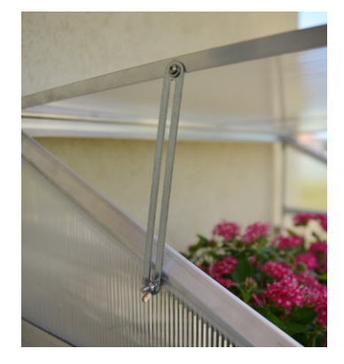
Adjustable upper vent