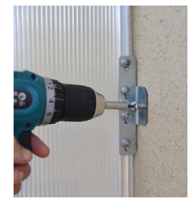
Wall mounting kit included